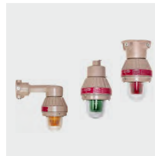
Hazardous Area Strobe Light Product Code: VESI/33U (Class/Div) Inquire for color and mounting options