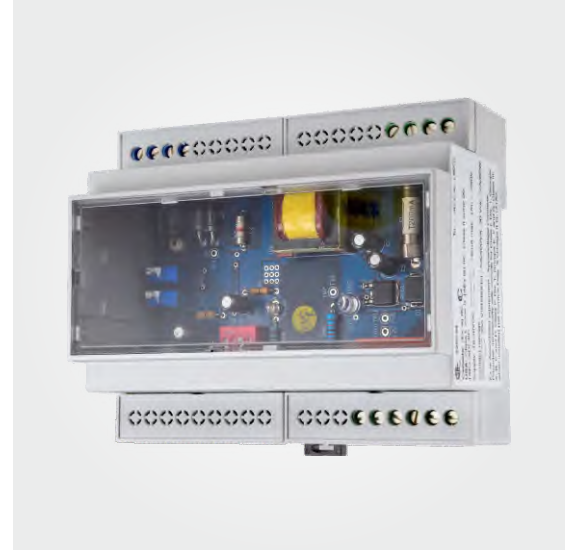
Earth-Rite OMEGA II

Two dry contacts can be used to switch power to additional ground status indicators or interlock with the process to shutdown product transfer when the OMEGA II detects an open circuit on the path to ground.