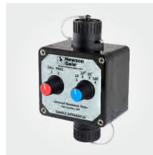
Universal Resistance Tester Product Code: URT.