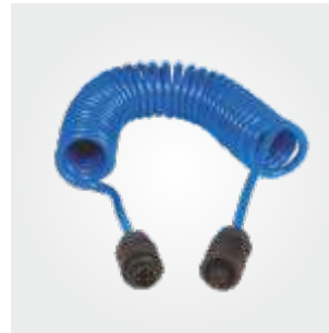
Cen-Stat cable supplied with male and female In-Line Quick-Connects.

The spiral cable provides effective retractability when the clamp is not in use, ensuring the cable is neatly stowed and safely out of the way.