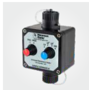
Universal Resistance Tester Product Code: URT.