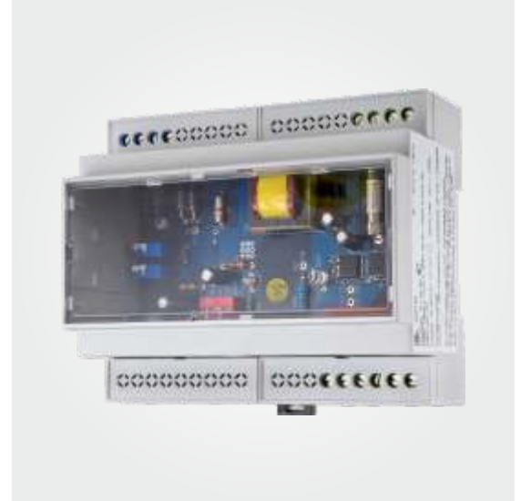
Earth-Rite OMEGA II

Two dry contacts can be used to switch power to additional ground status indicators or interlock with the process to shutdown product transfer when the Earth-Rite OMEGA II detects an open circuit on the path to ground.