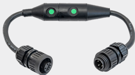
BAC – Break Away Connector

Newson Gale is proud to announce the launch of the BAC – Break Away Connector