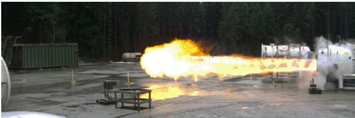
Fig 3. - A confined and vented dust explosion

There is often both a primary and secondary explosion allowing for a transition from fire to multiple explosions and vice versa. A primary explosion usually occurs inside the process vessel such as sieves, dryers, mixers, conveying systems and silos. It is within this environment that five elements of the dust explosion pentagon are met. The resulting impact of the first usually ignites the second. Unburned fuel from the primary explosion is ejected by the blast outside the enclosure causing dust to become airborne where it is susceptible to ignition and is able to create a secondary explosion. A secondary explosion can be more destructive than the primary due to the increased concentration of dispersed combustible dust and greater ignition source. The resulting shockwave of a first explosion will damage and often rupture the self-contained vessel where the initial blast manifested itself from, allowing the explosion to propagate through the plant.