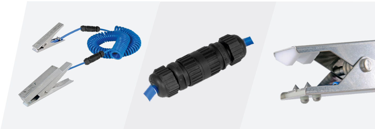
Bond-Rite EZ with large heavy duty clamp and 5m of Cen-Stat™ protected cable. Also available with standard size heavy duty clamp.