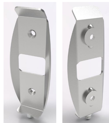
Magnetic Clamp Storage Point