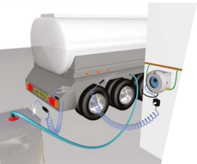
Example of grounded truck bonded to IBC

* Always check for and read the latest version of the International Standards, Guidance and/or Recommended Practices.