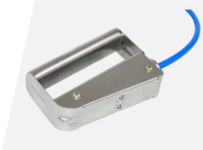
Tungsten carbide teeth are designed to penetrate rust, coatings and product deposits to achieve a low resistance connection

Tungsten carbide is one of the hardest materials used in industry today. When used in combination with very strong Neodymium magnets, has the capability to continuously bite through coatings, rust or product deposits that a basic alligator clip or welding clamp would struggle to achieve. Sharp tungsten carbide teeth are a standard feature of Newson Gale's heavy duty clamps.