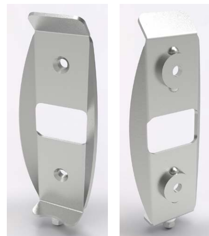
Magnetic Clamp Storage Point