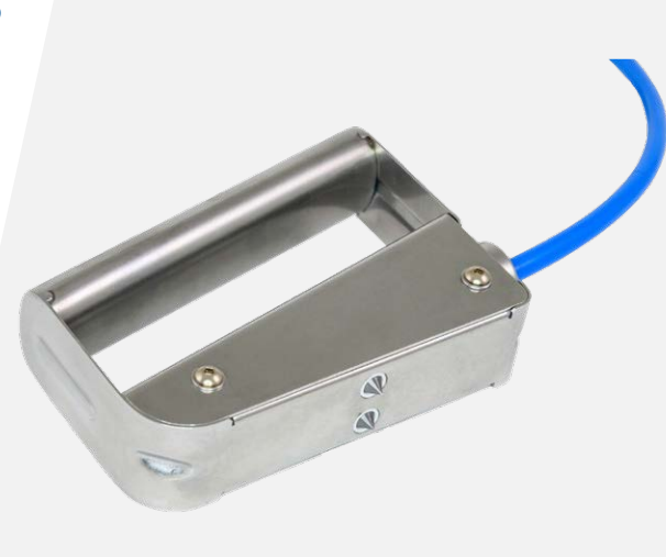
Tungsten carbide teeth are designed to penetrate rust, coatings and product deposits to achieve a low resistance connection

Tungsten carbide is one of the hardest materials used in industry today. When used in combination with very strong Neodymium magnets, has the capability to continuously bite through coatings, rust or product deposits that a basic alligator clip or welding clamp would struggle to achieve. Sharp tungsten carbide teeth are a standard feature of Newson Gale's heavy duty clamps.